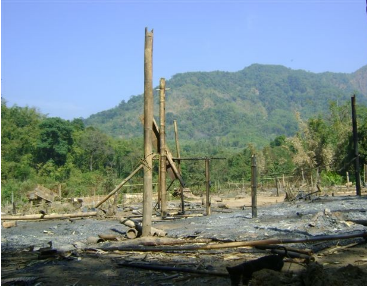
Village burned by the Burma Army