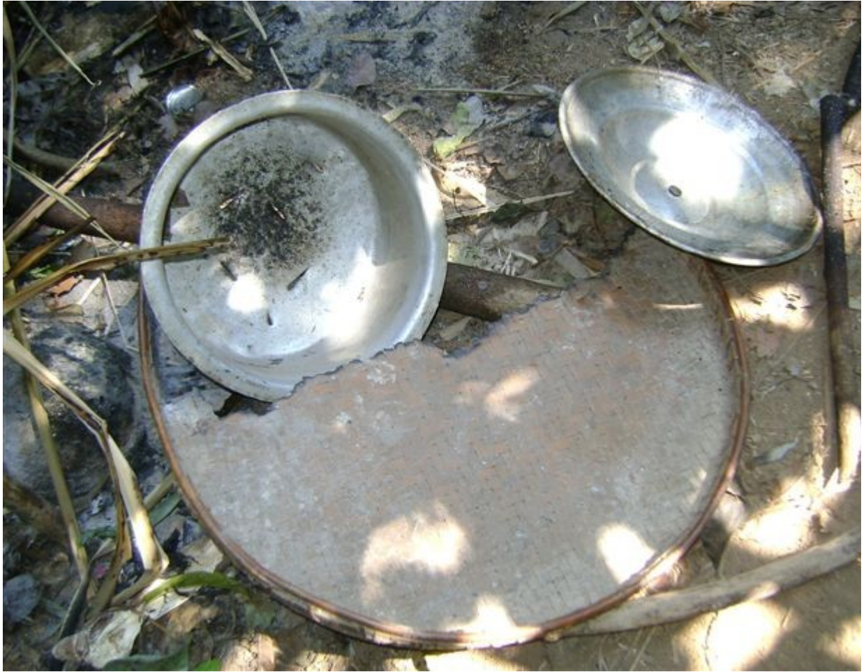
Belongings destroyed by the Burma Army