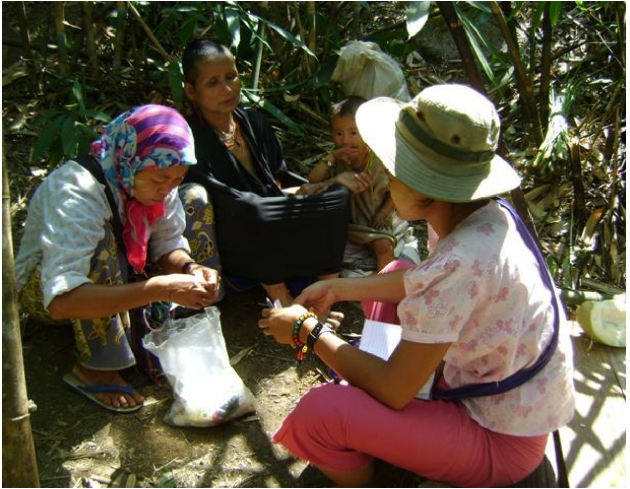
Relief team member distributing relief supplies