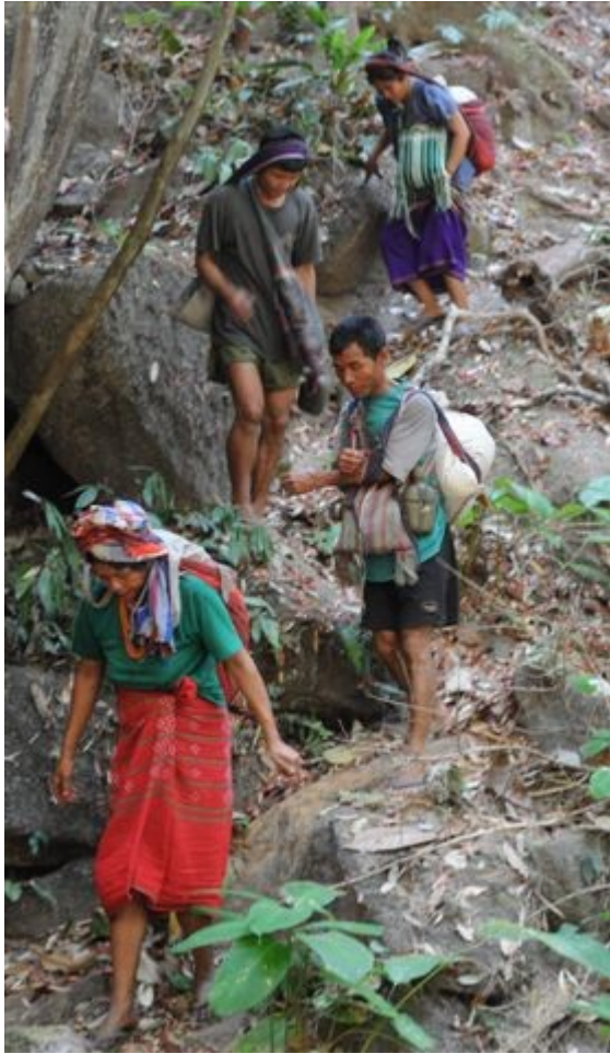
IDPs fleeing through the jungle