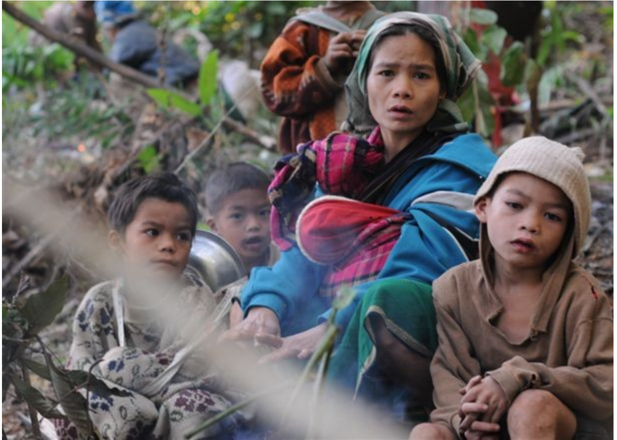
IDPs hiding in the jungle