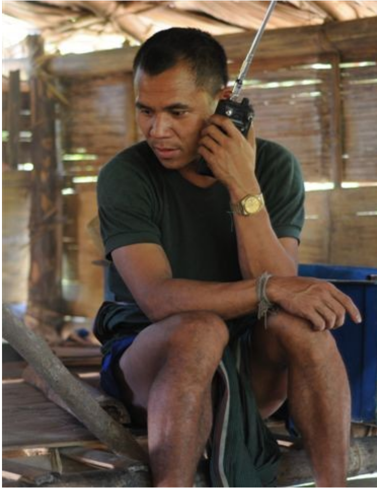
Early Warning radio in action