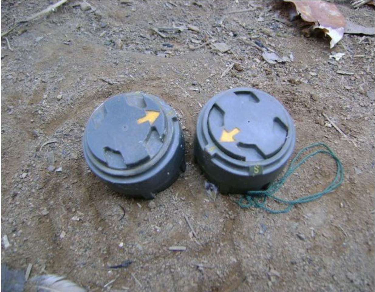
Landmines removed from village (BA M14s)