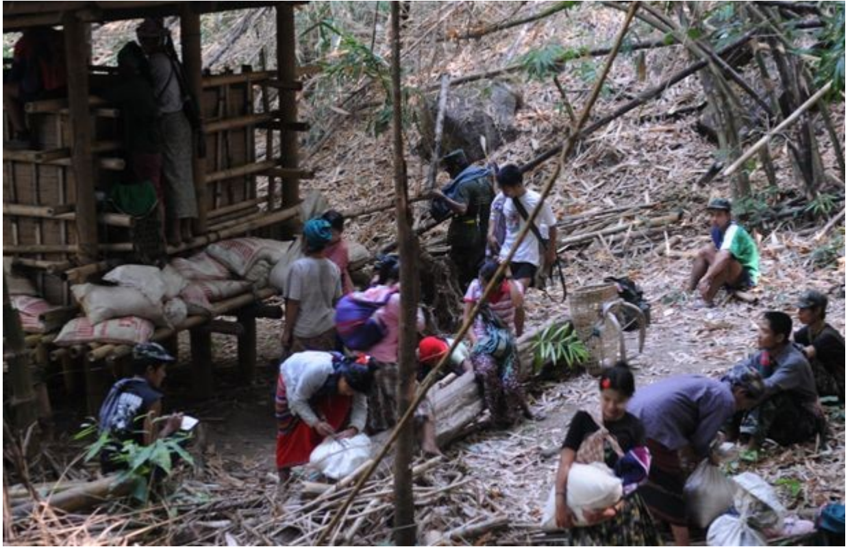
Villagers gathering rice