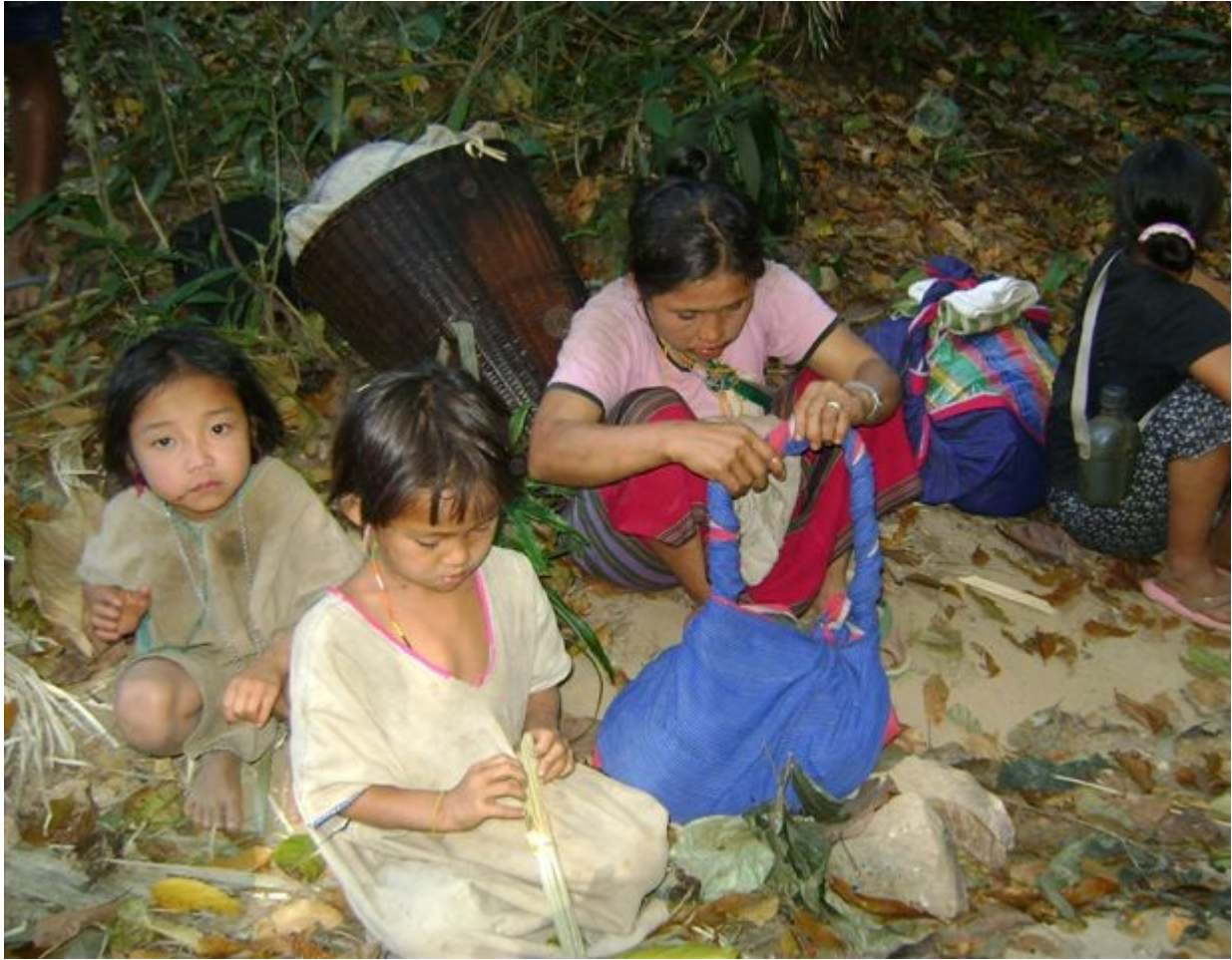
IDPs in hiding