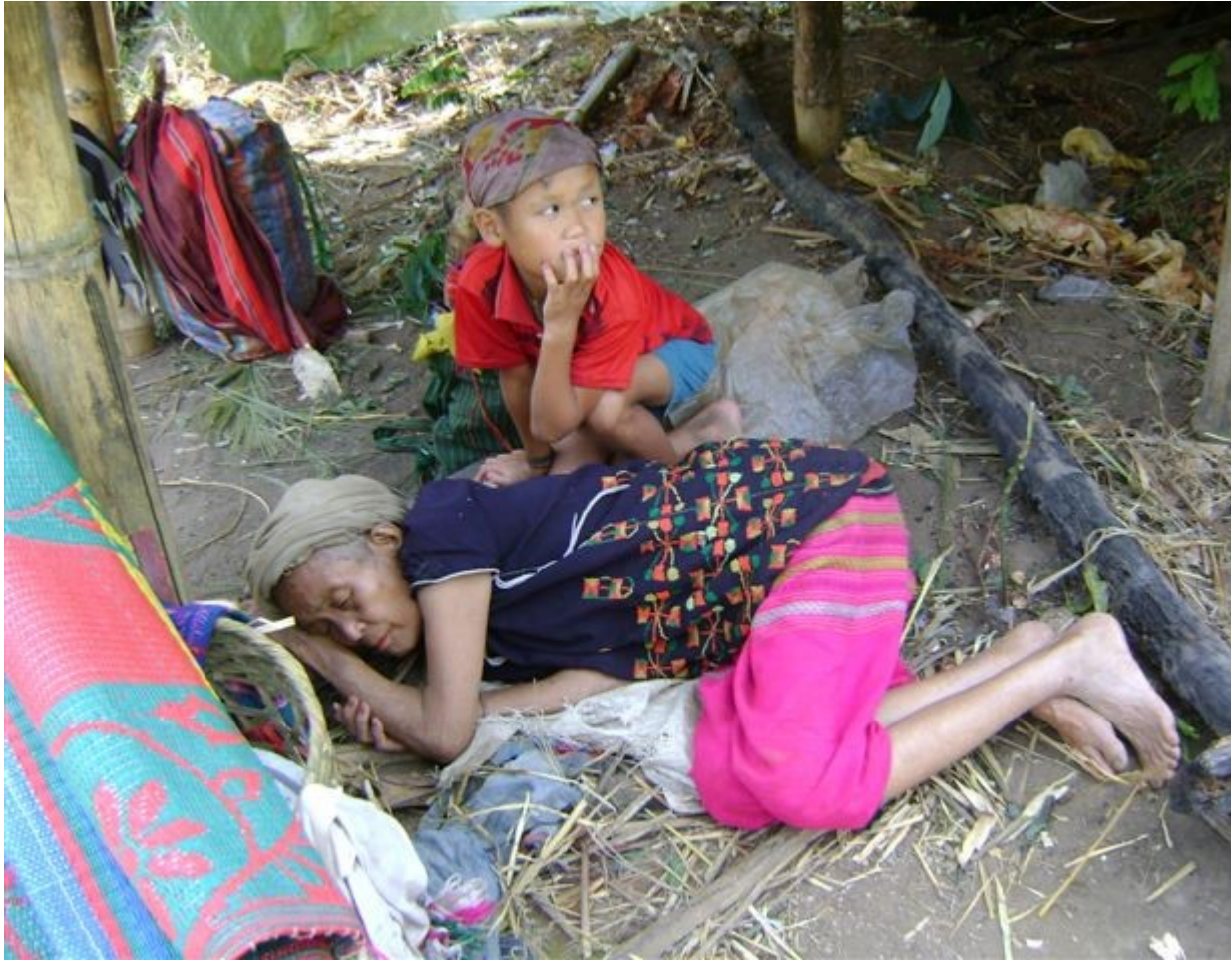
IDPs in hiding